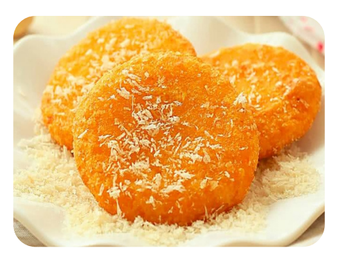
Sweet Pumpkin Glutinous Rice Pie (3 pieces) 金黄南瓜饼 (每份3个) £4.80 VG

Osmanthus Blossoms Refreshment Jelly 桂花冰粉 £3.90