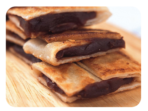
Red Bean Paste Pancake 豆沙锅饼 £6.80 V

Orange Flavoured Sweet Red Bean Soup VG Ice Cream (3 scoops) Soft Mochi & Gelato Ice Cream (2 pieces)