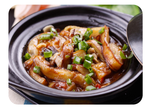
Diced Chicken & Salty Fish with Aubergine in Casserole 咸鱼鸡粒茄子煲 £13.80