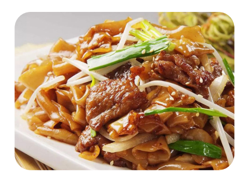
Stir-Fried Rice Noodles with Beef, Beansprout & Onion 干炒牛河 £11.80 VO