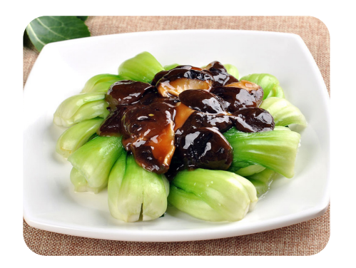
Braised Pak Choi with Chinese Mushrooms 冬菇扒棠菜 £12.80 VG