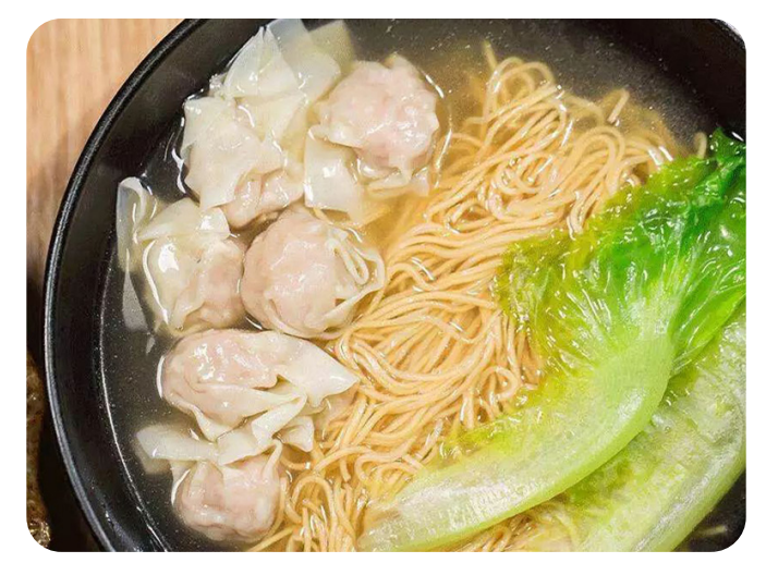
Wonton Noodles Soup (Pork) 馄饨汤面 £11.80