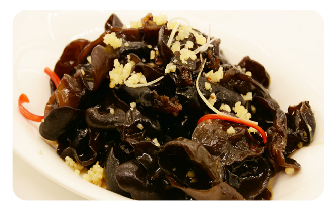
Black Fungus Salad with Crushed Garlic VG 蒜香黑木耳 £7.50