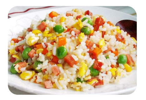
Yangzhou Fried Rice with Diced Ham, Shrimp, Sweetcorn, Peas & Carrot 扬州炒饭 £10.80