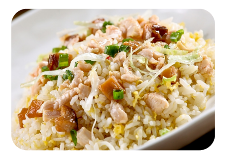
Diced Salted Fish and Chicken £10§.80