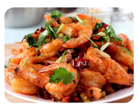
Fried King Prawns with Green & Red Chilli 香辣基围虾 £16.80 丿丿