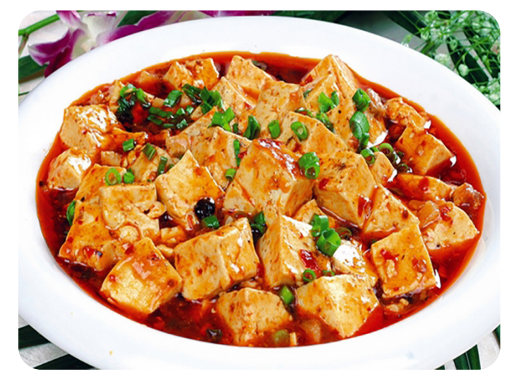
Szechuan Spicy Mapo Recipe Beancurd with Minced Beef 四川麻婆豆腐 £11.80 VGO 🔰