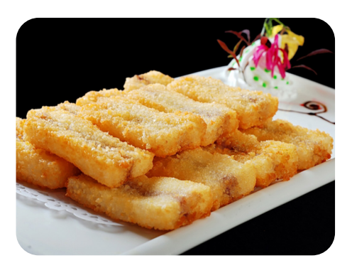
Egg & Glutinous Rice Cakes Garnished with Sesame & Suger (3 pieces) 蛋煎糍粑 (每份3个) £6.80 V