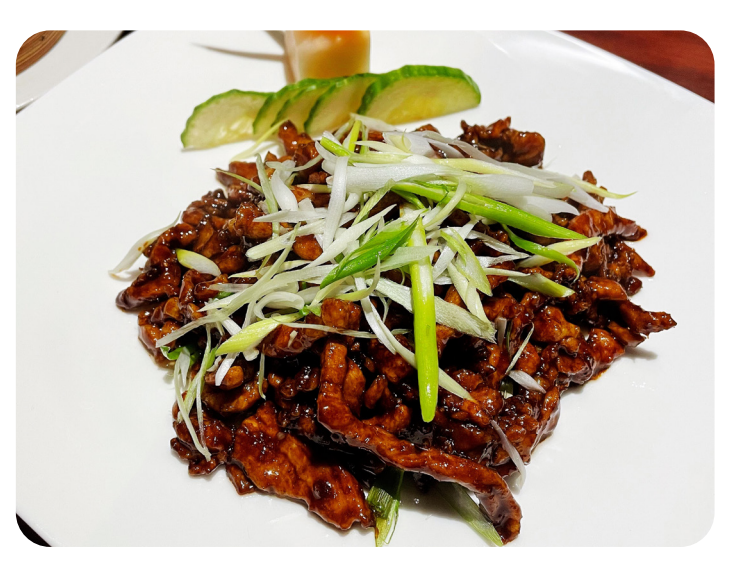
Sautéed Shredded Pork in Hoisin Sauce (Served with Pancakes) 京酱肉丝 (配鸭饼) £12.80

Braised Sliced Pork Belly with Preserved Cabbage 冬菜扣肉 £12.80