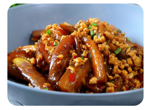
Braised Aubergine with Minced Pork 肉末烧茄子 £11.80