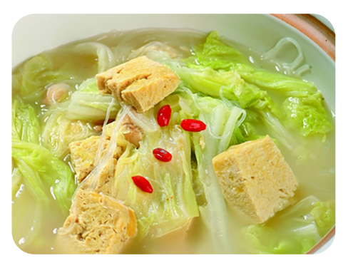
Poached Beancurd, Chinese Cabbage & Vermicelli in Casserole 砂锅粉丝白菜豆腐 £11.80 vG