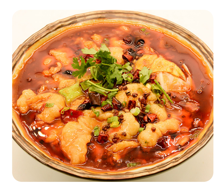
Super Spicy Hot Poached Basa Fish Fillet in Chilli Oil 水煮白鱼 £13.80 ♪♪♪