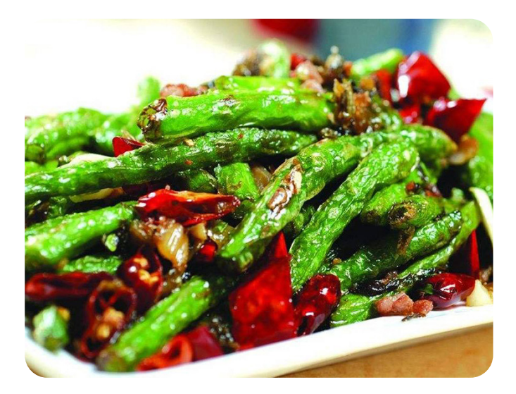
Stir-Fried French Bean with Chilli with Minced Pork 干煸四季豆 (配猪肉碎) £11.80 🏓