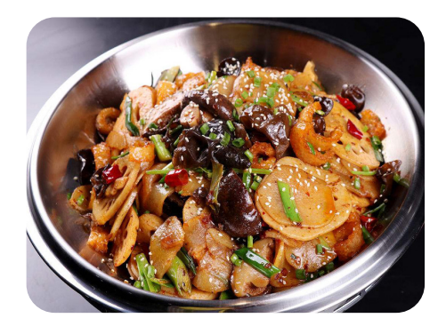
Fungus & Mushroom in Hot & Spicy Clay Pot 菌类麻辣什锦 £12.80 VG ///