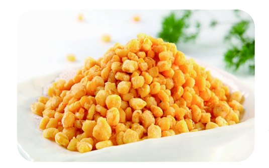
Fried Sweet Corn Coated with Salty Duck Egg Yolk 咸蛋黄玉米粒 £12.80 V