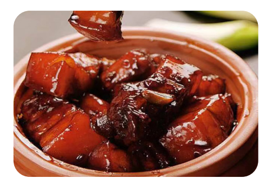
Braised Pork Belly in Brown Sauce 外婆の红烧肉 £12.80