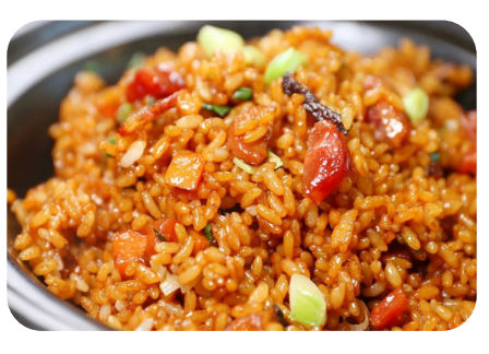
Diced Chinese Dried Bacon & Chinese Sun-Dried Sausage Fried Rice Fried Rice 咸鱼鸡粒炒饭 腊味炒饭 £10.80