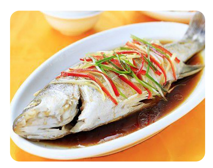
Steamed Whole Seabass with Soy Sauce 清蒸鲈鱼 £18.80

Crispy Whole Seabass with Sweet & Vinegar Sauce 糖醋脆皮鱼 £19.80