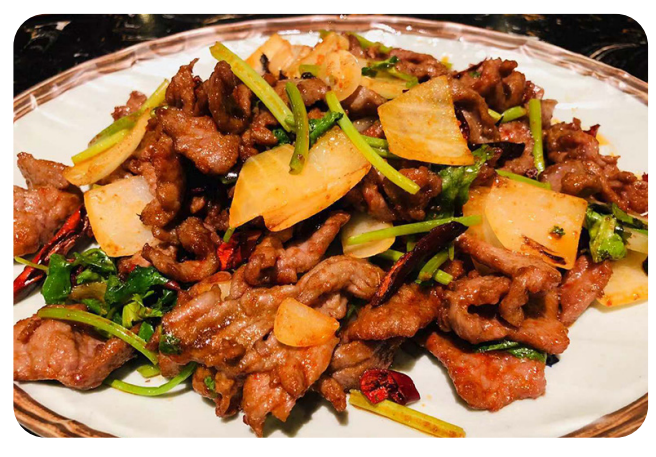
Stir-Fried Hot Roast Sliced Mutton OR Beef with Onion, Cumin & Coriander 孜然羊肉/牛肉 £11.80 JJ