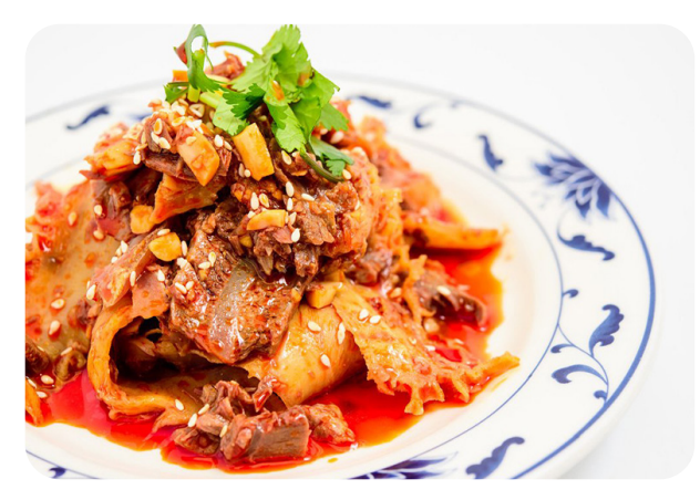
Cold Sliced Ox's Heart, Ox's Tongue, Ox's Tripe in Chilli Sauce with Crushed Peanuts 夫妻肺片 £8.80