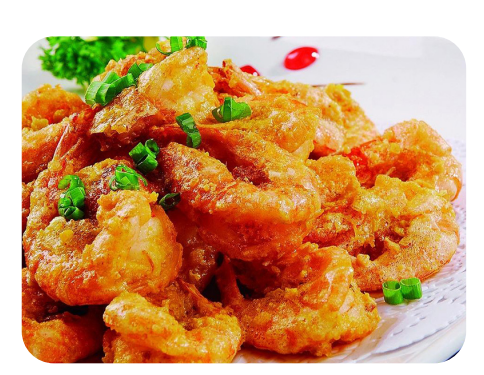
Fried King Prawns with Salty Duck Egg Yolk 咸蛋黄酥炸白虾 £16.80