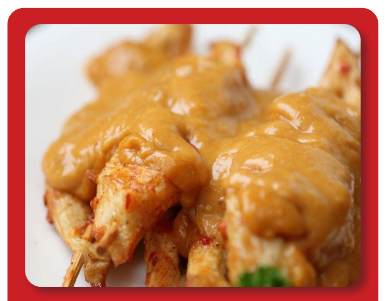
Chicken Skewer 🥑 with Peanut Satay Sauce (4 pieces) 沙爹鸡串 (每份4串) £9.80

Veggie Chicken Skewer 🥑 VG with Peanut Satay Sauce (4 pieces) 斋沙爹鸡串 (每份4串) £8.80