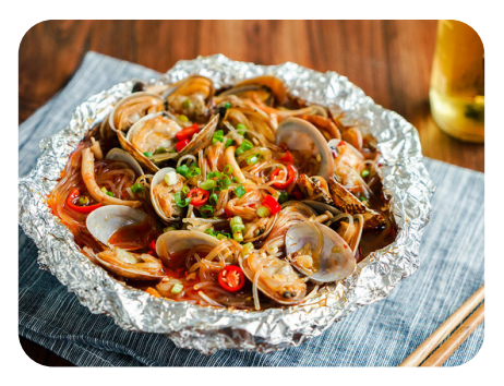
Vermicelli with Clams (on Shell) in Spicy Soup 开心花甲粉 £11.80 ///