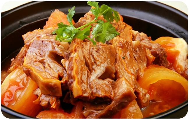
Home Recipe Stewed Beef Brisket & Tomato in Casserole 锅仔番茄炖牛腩 £12.80