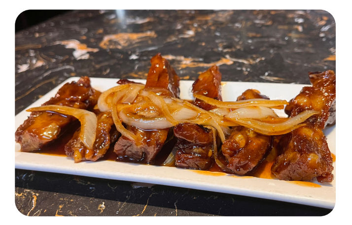
Spare Ribs in OK Sauce OK蜜汁排骨 £9.80