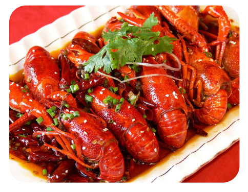
Hot & Spicy Crayfish 麻辣小龙虾 £20.80 (M) / £31.80 (L) 少少少

Soft Shell Crab <u>Salt & Pepper</u> OR <u>Garlic & Salt</u> 软壳蟹 (椒盐/金沙) £16.80