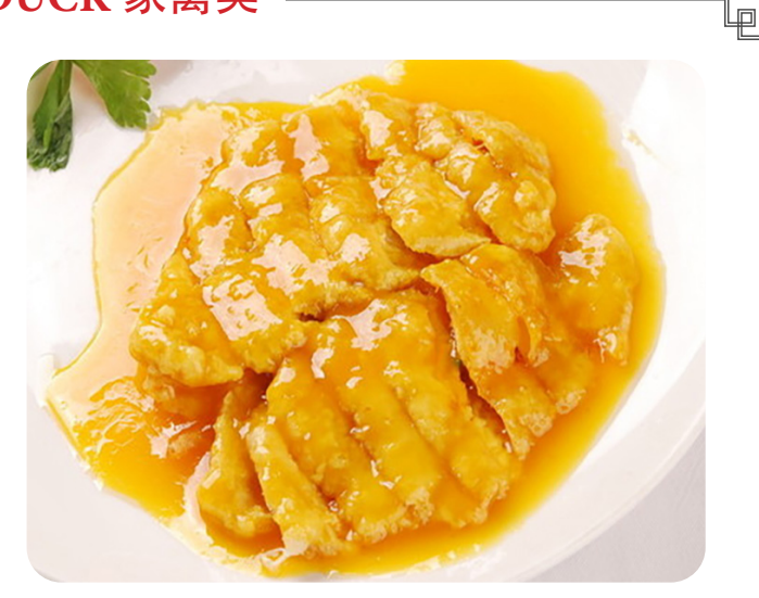
Deep-Fried Chicken Breast Fillet with Honey & Lemon Sauce 柠檬鸡排 £12.80