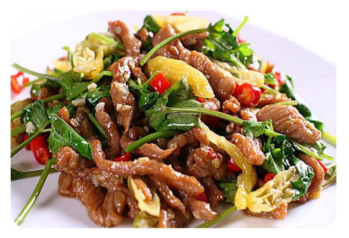
Sautéed Sliced Beef Fillet with Pickled Green Pepper 野山椒炒牛肉 £12.80 /