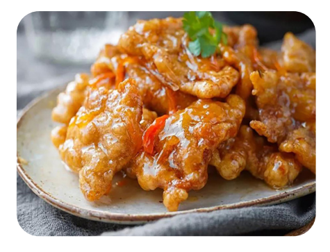
Crispy Fried Pork Tenderloin in Sweet & Vinegar Sauce 糖醋里脊 £12.80