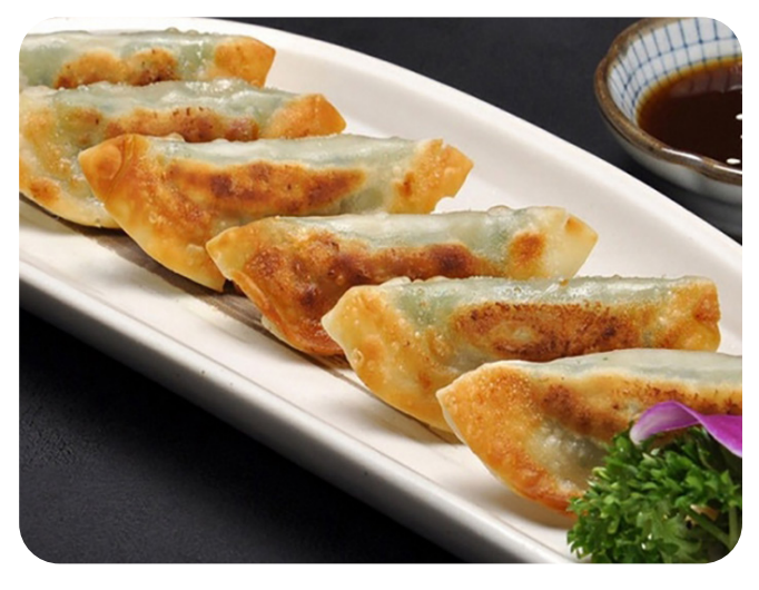
Guotie – Shallow Fried Beijing Style Minced Pork Dumplings (6 pieces) 京味锅贴 (每份6个) £7.80