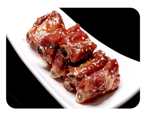
Braised Spare Ribs (with Sweet & Vinegar OR Brown Sauce) 糖醋排骨 (红烧排骨) £12.80