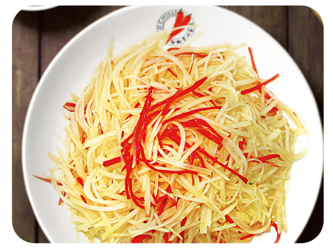
Sautéed Shredded Potato with Sliced Chilli 尖椒土豆丝 £9.80 VG