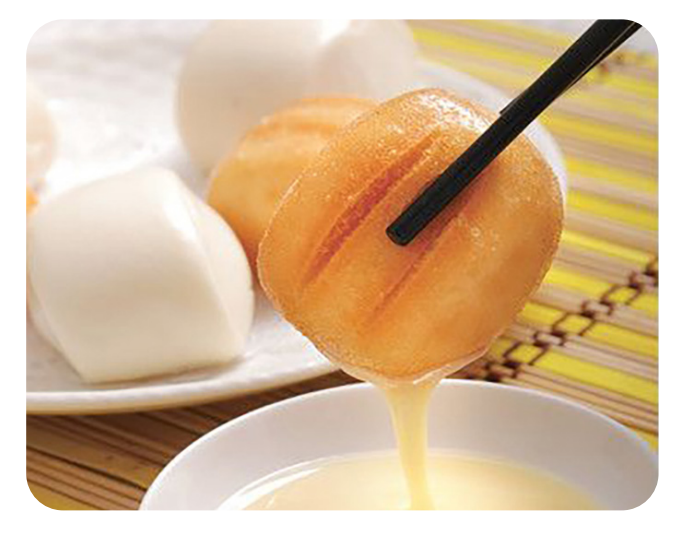
Steamed Buns with Golden Crispy & White Soft Skin Served with Condensed Milk (8 pieces) 金银小馒头(配1份炼乳) £8.80 V