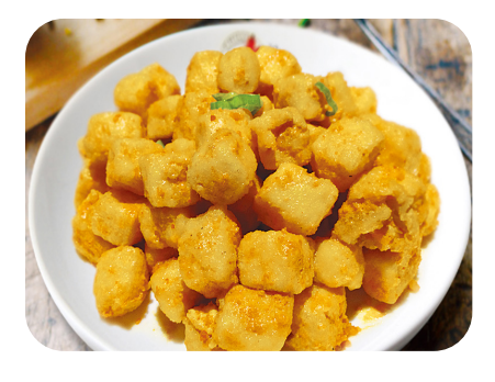
Fried Beancurd Coated with Salty Duck Egg Yolk 咸蛋黄焗豆腐 £12.80 V