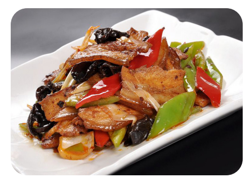
Sautéed Sliced Pork Belly with Chilli 山城回锅肉 £11.80 ┛┛