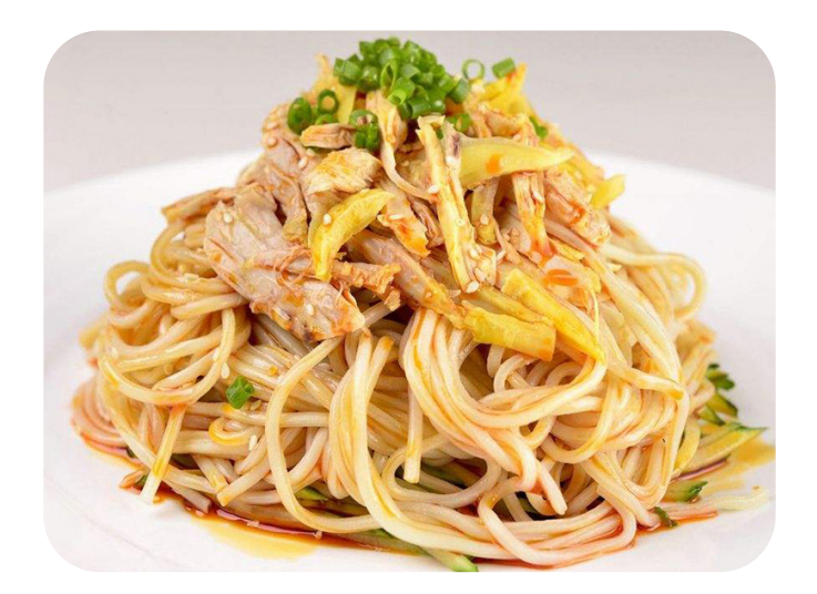
Sichuan Style Noodles with Sesame Chilli Sauce & Shredded Chicken (Cold) 川味鸡丝凉面 £11.80 J J