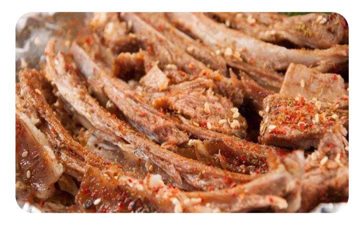
Grilled Lamb Chops with Cumin & Dried Chilli Powder 风味羊排 £12.80 ∮