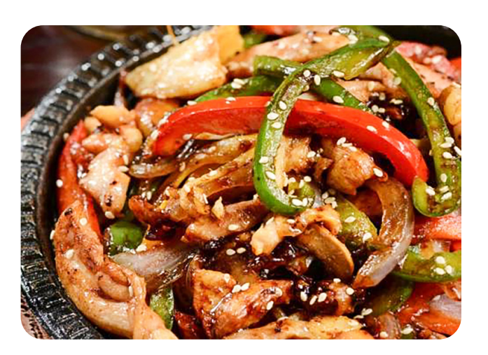
Sizzling Sliced Duck with Green & Red Pepper in Black Bean Sauce 铁板豉椒鸭片 £14.80