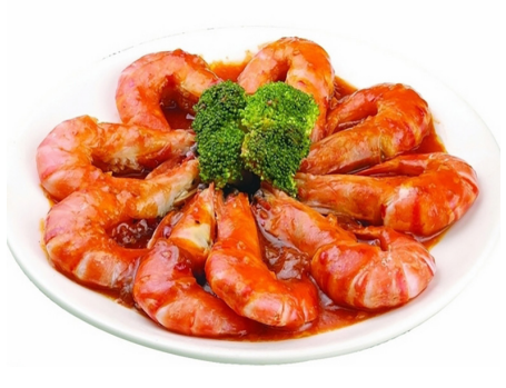
Sautéed King Prawns with Ginger & Spring Onion in Sweet Tomato Sauce 油焖大虾 £16.80