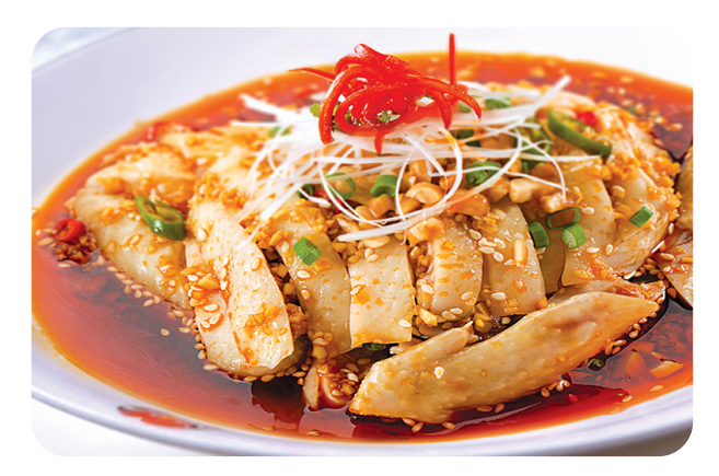
Cold Steamed Chicken in Home-Made Style Chilli Sauce 家乡口水鸡 £8.80 J