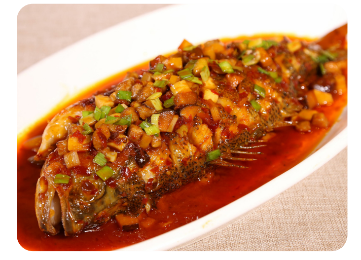
Pan-Fried Whole Seabass with Garlic, Mushroom, Bamboo Shoots & Minced Pork 干烧鲈鱼 £19.80 J J