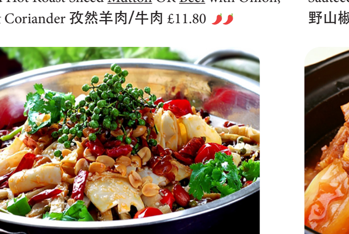
Griddle Cooked Spicy Aorta 干锅黄喉 £13.80 /