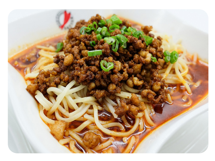
Sichuan Dandan Noodles with Minced Pork & Chilli Sauce in Soup 四川担担面 £10.80