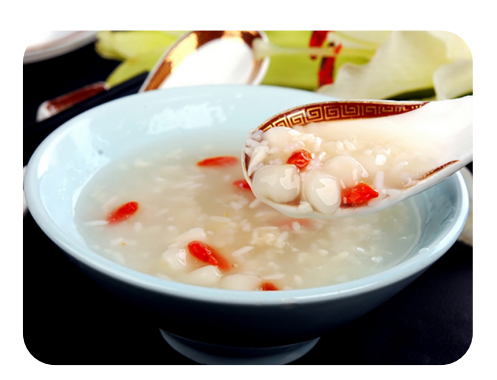
Sweet Stuffed Glutinous Rice Balls 酒酿丸子 £5.80 VG