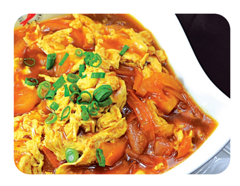
Braised Tomatoes & Egg on Noodles 番茄鸡蛋卤面 £10.80 V

Singapore Style Vermicelli (with or without Ham & Shrimp) 星洲炒米粉(火腿虾仁) £10.80 🍠 VO