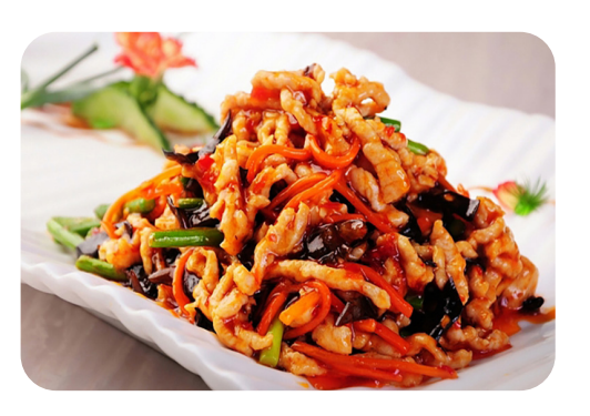
Sautéed Shredded Pork with Black Fungus in Sweet & Spicy Garlic Sauce 鱼香肉丝 £11.8())